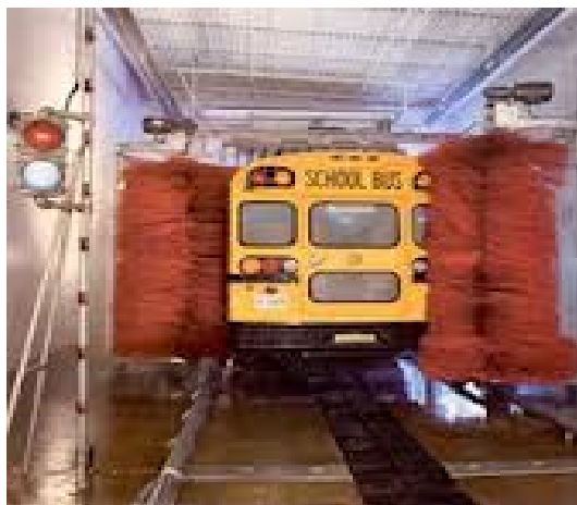
Sample system and approximate cost per system - $132,000

Three of the district’s bus washes are outdated and obsolete as they were installed when the transportation facilities were built. Parts are no longer available and are fabricated by the only vendor qualified to work on the equipment.