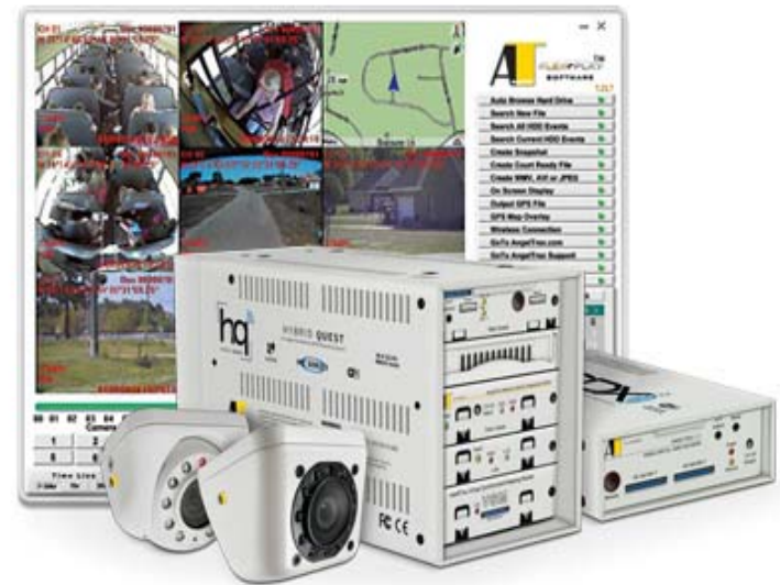
FlexPlay / TR3600HR and FC8000 cameras / Hybrid Quest and SDX DVRs

200 outdated/obsolete DVR's need replacing due to failures