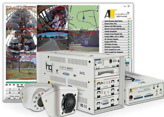
FlexPlay / TR3600HR and FC6000 cameras / Hybrid Quest and SDX DVRs

Each district school bus assigned to a route is equipped with a digital student/driver video surveillance system to promote student safety, protect drivers from fraudulent claims, enforce good driving practices and deter vandalism. As with most computerized systems, hard-drives and other components must be updated and/or replaced due to failure and/or obsolete technology. A complete new system with three (3) cameras and digital video recorders (DVR's) costs approximately $2,200 installed. Two-hundred of these DVR's are outdated (7-plus years old) and need to be replaced due to failure with the newer digital video recording (DVR) system technology. 320 systems will need to be replaced or upgraded in 2016 but will be included in the purchase of new school buses. The cameras of these systems are in good condition, do not need replacing and are expected to last the life expectancy of the school buses. The upgraded DVR's cost approximately $1,100 - $1,200 for a total of $220,000 to $240,000.